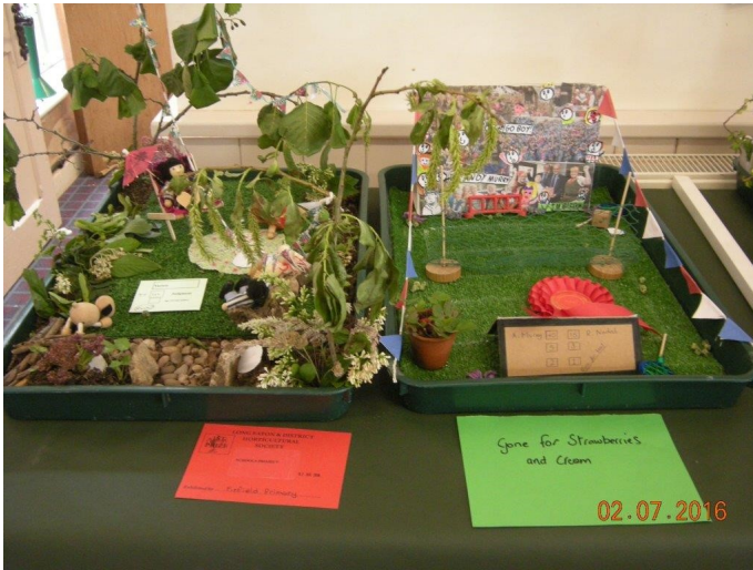
field Primary School