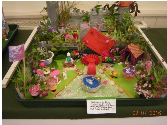
The Elms Junior School