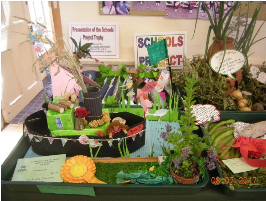
Joint 3rd prizes