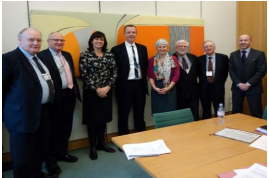
Representatives of the Trust, Devizes CAB and Claire Perry MP with Planning Minister Nick Bowles

One outcome of the protest rally against the proposed development at Coate Bridge was the intervention of our MP, Claire Perry, who arranged for a delegation from the town to meet Nick Boles, the Planning Minister.