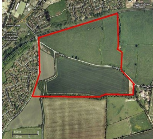
The map shows the approximate extent of the development, with Windsor Drive to the west and the canal to the north.

In 2011 a Scottish company, Mactaggart & Mickle (M&M), appeared in Devizes seeking opinions on a proposal to build around 350 houses on land to the East of Windsor Drive. That company was told that the local community did not want the development because it would not meet local needs and would add to our problems caused by too many housing estates. Not deterred, they returned last year and launched a second consultation. Why are they here and have they ever laid a single brick outside Scotland? M&M started as genuine house builders in Glasgow but, after the retirement of their founders, new directors seem to have decided that land speculation in England would be more rewarding than building in Glasgow. M&M could obtain planning permission then sell the land, let another company do the building and leave our community to suffer the consequences.