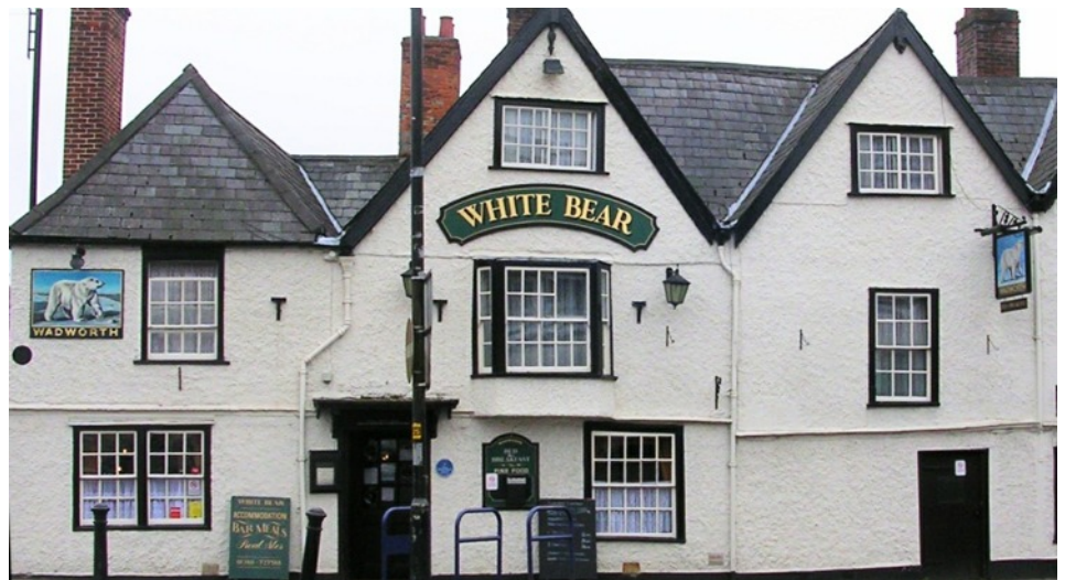
Above, the original signs. Below, the new ones.